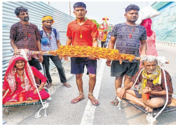
Four brothers, carrying their parents on their shoulders leave after taking a dip in Nilkanth, Rishikesh and Haridwar during the Kanwar Yatra, in Haridwar

As in Muzaffarnagar, hotels, dhabas and roadside eateries along the yatra route in Uttarakhand have been asked to display their owners' names, addresses and mobile phone numbers. The Uttarakhand decision will mostly cover Haridwar but some 'kanwariyas' also visit Rishikesh, Neelkanth and Gangotri as part of the yatra which begins on July 22.